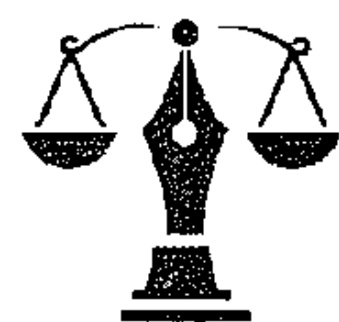
EXHIBIT A ZARZAUR & SCHWARTZ, P.C. Attorneys at Law

P.O. Box 11366, Birmingham, Alabama 35202-1366 2209 Morris Avenue, Birmingham, Alabama 35203-4211 Local (205) 250-5400 Collection Department Toll Free (800) 401-6789 Collection Department Hours of Operation Mon-Thu (8:30AM to 5:00 PM) Fri (8:30AM to 4:30 PM) TRS 711 TTY (800) 548-2546 Fax (205)328-1958