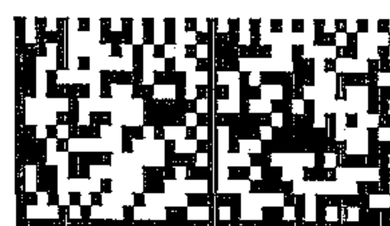
EXHIBIT "A" LEGAL DESCRIPTION