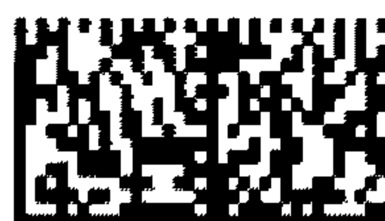
EXHIBIT "A" LEGAL DESCRIPTION