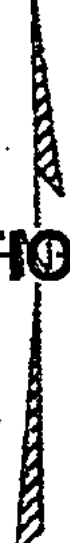
EXHIBIT 'A' LEGAL DESCRIPTION

20251112000347390 3/3 $133.00 Shelby Cnty Judge of Probate, AL 11/12/2025 01:32:45 PM FILED/CERT