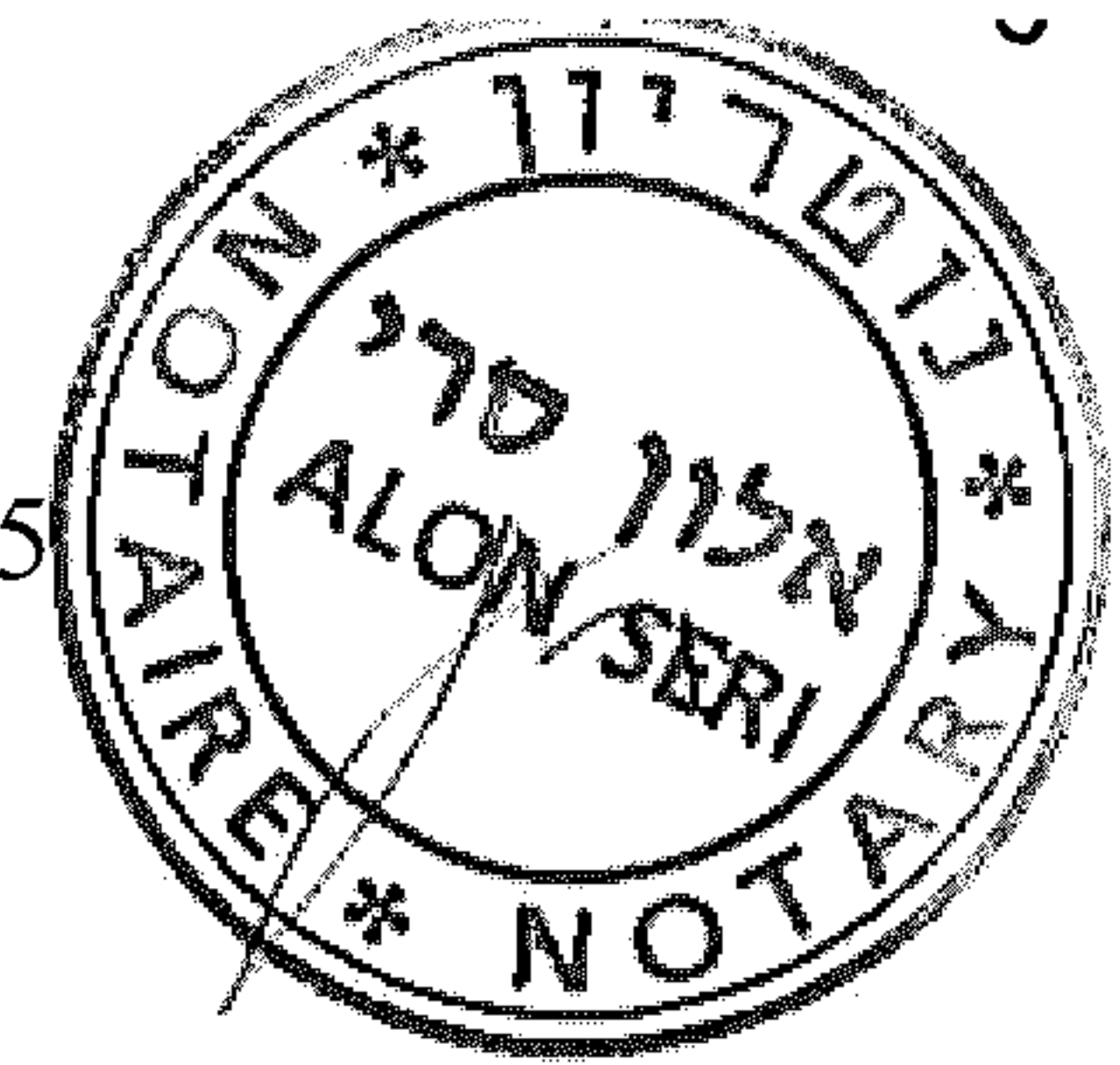
EXHIBIT "B" PLANNED UNIT DEVELOPMENT RIDER

THIS PLANNED UNIT DEVELOPMENT RIDER is dated as of December 1, 2021 , and is incorporated into and shall be deemed to amend and supplement the Mortgage, Assignment of Rents and Security Agreement (the " Mortgage ") of the same date, given by the undersigned (the " Borrower ") to secure Borrower's Promissory Note (the " Note ") to ATHAS CAPITAL GROUP, INC. , a California corporation (the " Lender "), of the same date and covering that certain real property described in the Mortgage and located at: 310 Lane Park Trail, Maylene, AL 35114 (the " Mortgaged Property "). The Mortgaged Property includes, but is not limited to, a parcel of land improved with a dwelling, together with other such parcels and certain common areas and facilities, as described in a declaration or other document establishing a planned unit development and related covenants, conditions and restrictions affecting the Mortgaged Property (the " Declaration "). The Mortgaged Property is a part of a planned unit development known as GRAND VIEW ESTATES (the " PUD "). The Mortgaged Property also includes Borrower's interest in the homeowners association or equivalent entity owning or managing the common areas and facilities of the PUD (the " Owners Association ") and the uses, benefits and proceeds of Borrower's interest.