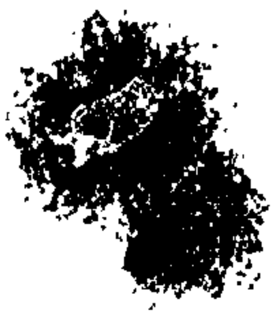
EXHIBIT A - LEGAL DESCRIPTION