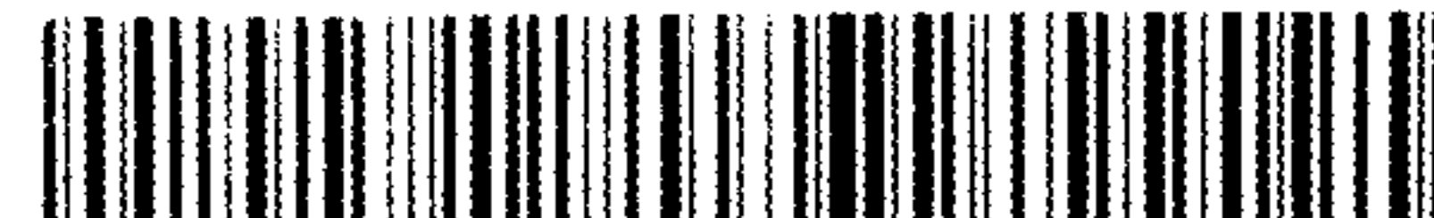
Sheila D. Simmons

20141112000355350 1/2 $165.00 Shelby Cnty Judge of Probate, AL 11/12/2014 10:13:30 AM FILED/CERT