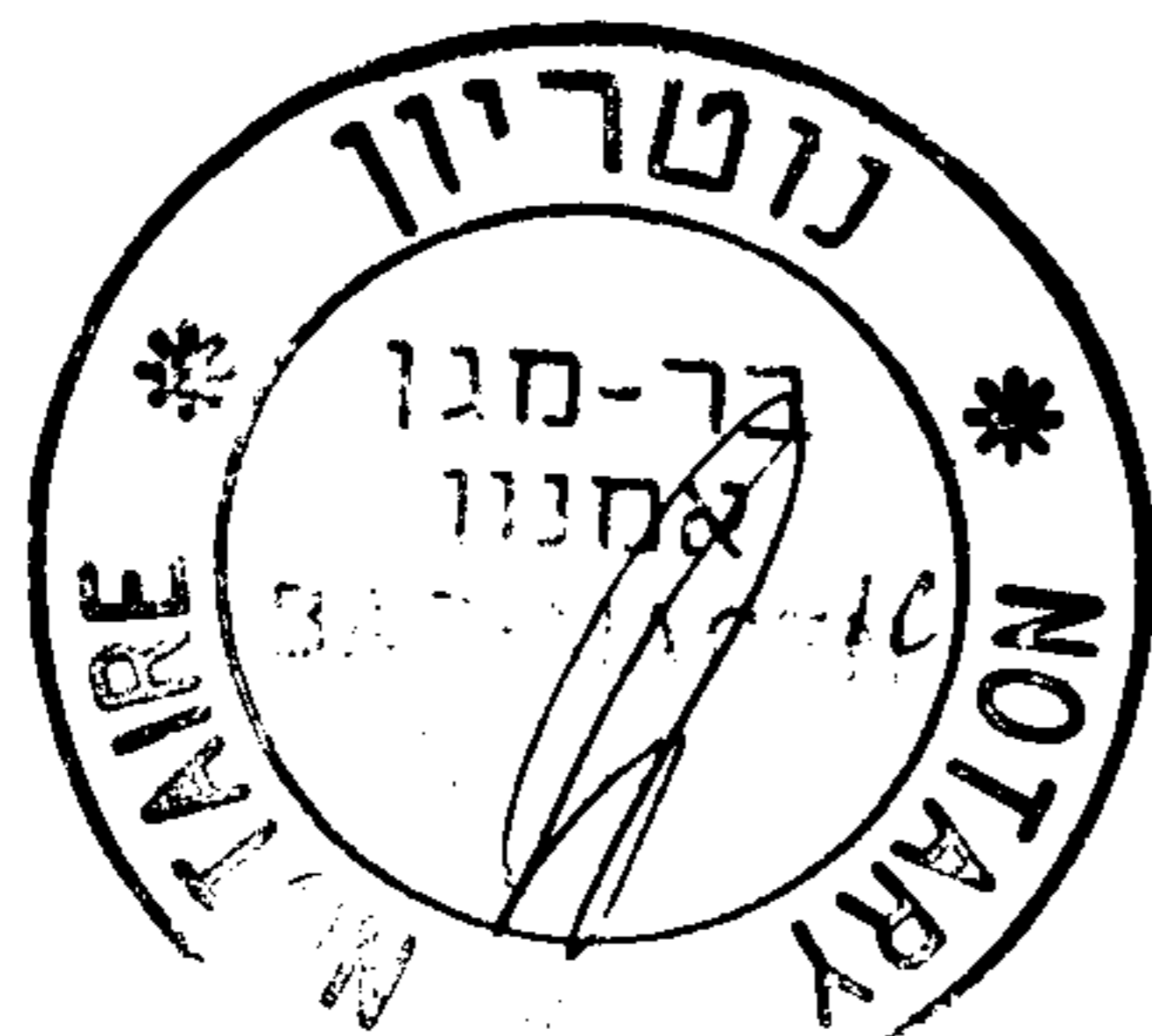
חתימת הנוטריון Signature

אני החתום מטה אמנון בר-מגן נוטריון , מדרך נגבה 46 רמת-גן ישראל טל. 03-6749199, מאשר כי ביום 08 אוגוסט 2013 ניצב לפני במשרדי מר רונן גפר-רומנו שזהותו הוכחה לי על פי תעודת זהות מספר 027298744 שהוצאה על ידי משרד הפנים ברמת גן ביום 09.08.2010, וחתם מרצונו החופשי על המסמך המצורף והמסומן באות A1-A2 .