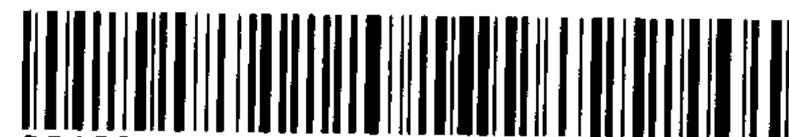
Amy B. Arnold

20120313000088140 3/3 $18.00 Shelby Cnty Judge of Probate, AL 03/13/2012 02:34:18 PM FILED/CERT