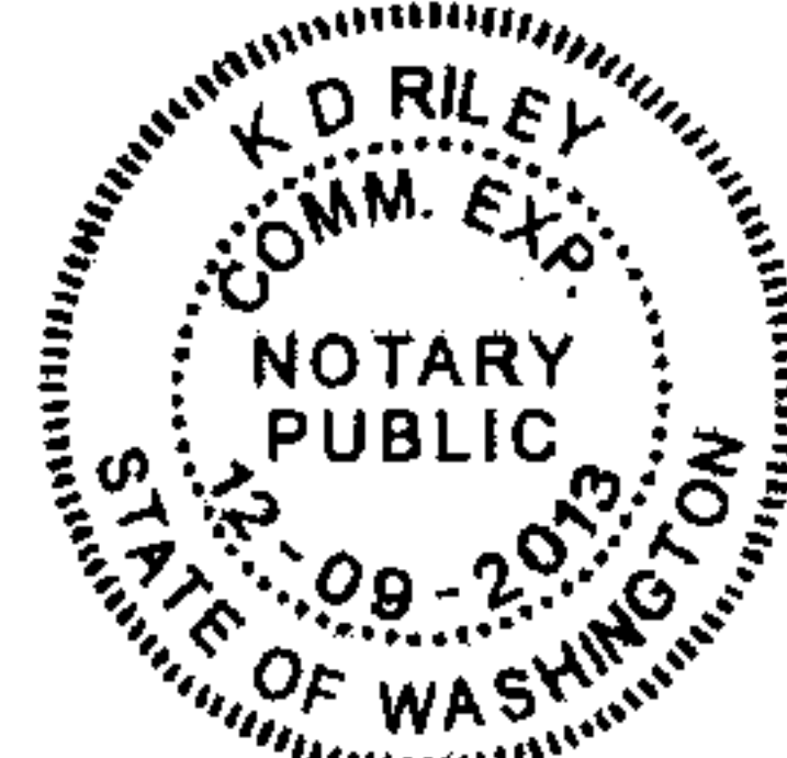
Notary Public in and for County of King, State of Washington My Commission expires December 9, 2013

IN TESTIMONY WHEREOF, I have hereunto set my hand and affixed my Official Seal at the City of Seattle, State of Washington, the day and year first above written.