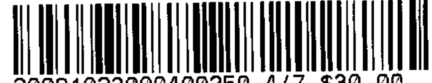
EXHIBIT A – CONSENT JUDGMENT

20091023000400250 4/7 $30.00 Shelby Cnty Judge of Probate, AL 10/23/2009 03:10:27 PM FILED/CERT