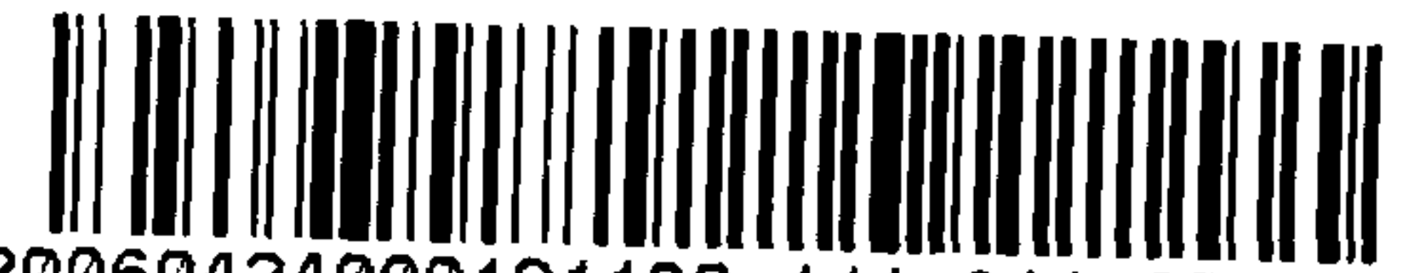
Exhibit 13-A to Alabama - HB - 3550, Chapter 13

20060424000191130 1/1 $11.00 Shelby Cnty Judge of Probate, AL 04/24/2006 03:46:16PM FILED/CERT