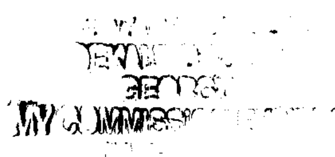
Notary Public Shelby County