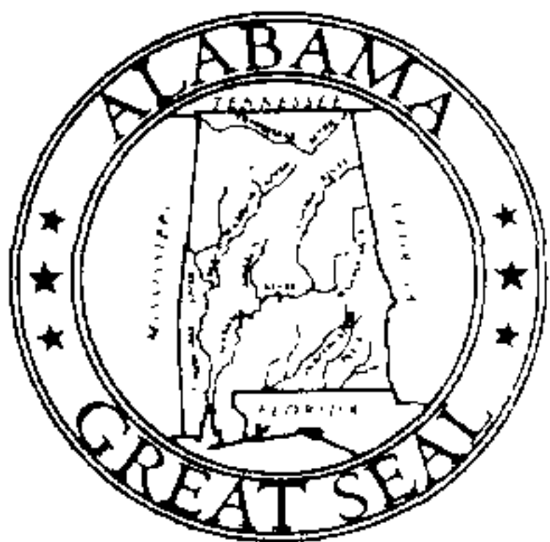
BOB RILEY GOVERNOR