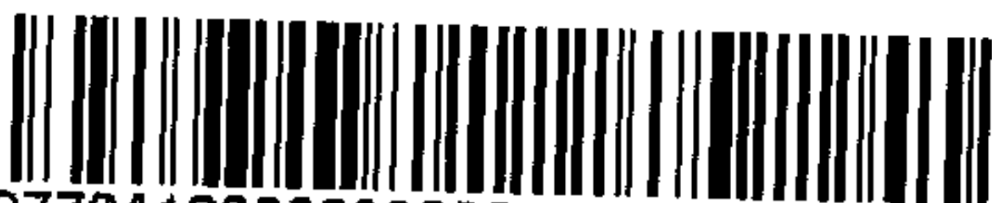
Charles A. Knowles

19770412000033820 1/2 $.00 Shelby Cnty Judge of Probate, AL 04/12/1977 12:00:00AM FILED/CERT