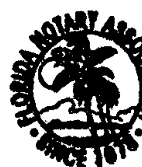
DANIELLE KENNEDY - NOTARY PUBLIC COMM: EXPIRES 06/26/2017

DANIELLE KENNEDY NOTARY PUBLIC STATE OF FLORIDA Comm# FF031287 Expires 6/26/2017