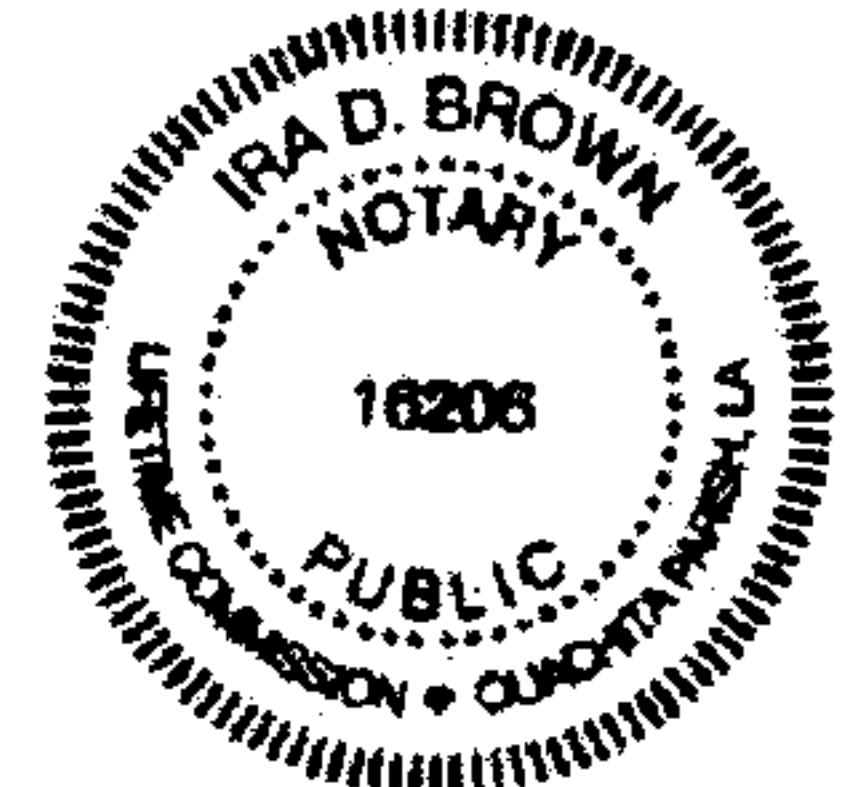
IRA D BROWN - 16206, Notary Public LIFETIME COMMISSION

Loan Number: 1995324491 Outbound Date: 01/29/15 MIN: 100046730010593917 MERS Phone, if applicable: 1-888-679-6377 MERS Address, if applicable: P.O. Box 2026, Flint, MI 48501-2026