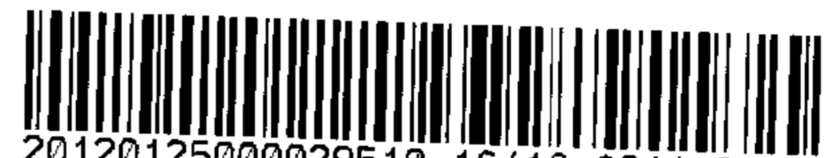
Exhibit "A" Legal Description

20120125000029510 16/16 $211.80 Shelby Cnty Judge of Probate, AL 01/25/2012 11:33:40 AM FILED/CERT